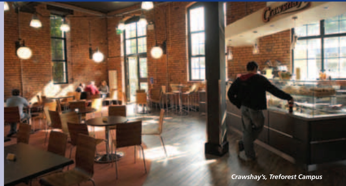
Crawshay's, Treforest Campus

It is essential that you consider these factors before you submit your accommodation application form or accept your contract, because you will be entering into a legally binding agreement for a fixed period. Once you have signed and accepted this agreement, the University may not be in a position to release you from your contract without penalty.