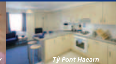
Tŷ Pont Haearn