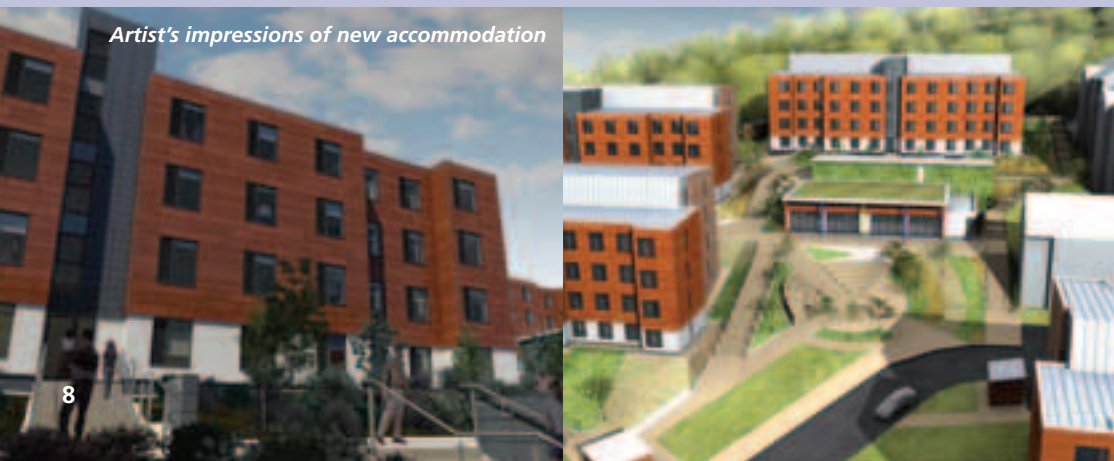
Artist's impressions of new accommodation

The Students' Unions at our Treforest and ATRium campuses also serve meals, snacks and drinks at student-friendly prices. From the legendary club sandwiches to curry night, you can dine out in style at the Union.